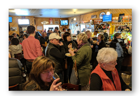
Third Thursday Networking Event located at Wheaty's Pub